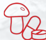
Pharmaceuticals & Nutraceuticals