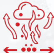
Evaporation, Distillation & Separation