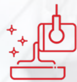
Foundry & Metalcasting

Custom Process Solutions. Tested Here. Proven Around the World.