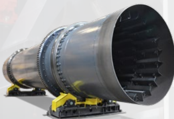
Rotary Dryers / Coolers