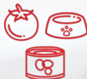
Food & Pet Food