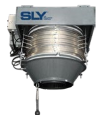
Bulk Solids Loading Spouts