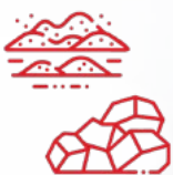
Sand & Aggregates