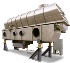
Vibratory & Static Fluid Bed Dryers / Coolers

Carrier Vibrating Equipment engineers machinery for unique processing requirements. From initial design to performance testing to final installation, Carrier can solve the most demanding processing issues. We specialize in design and manufacture of vibrating conveyors, feeders, screeners, fluid bed dryers and coolers, and more.