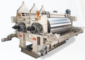
Atmospheric & Vacuum Drum Dryers

Buflovaks' products range from dryers and flakers to evaporation, distillation and separation equipment. We specialize in providing engineering driven solutions for food, chemical, pharmaceutical and environmental processes. Our products provide expert drying or cooling solutions tailored to our customer's process needs.