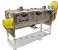
Batch & Continuous Mixers