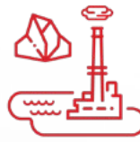
Coal & Fly Ash