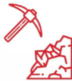
Mining & Minerals