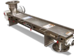
U-Trough Screw Conveyors