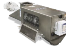
Screeners & Separators