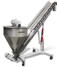
Split Tube Screw Conveyors