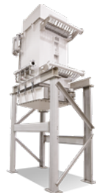
Bulk Material Heating / Cooling Exchangers