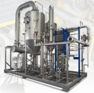
Evaporation, Distillation & Separation Systems