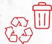
Recycling & Waste-To-Energy