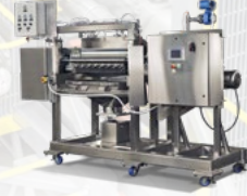
Cooling Drum Flakers