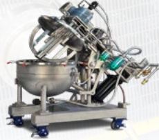
Vacuum Shelf, Pan & Rotary Dryers