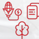
Biomass, Paper & Wood