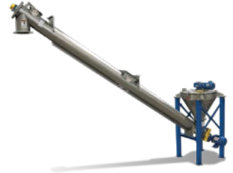
Tubular Screw Conveyors