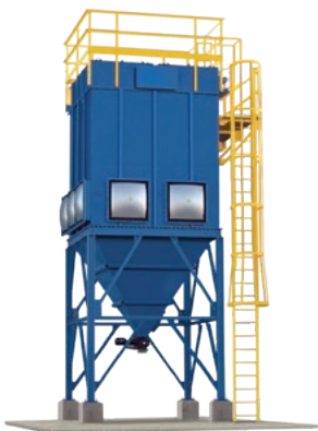
Dry Dust Collectors

Sly designs and manufactures a high-quality line of reliable baghouses, dust collectors, wet scrubbers, loading spouts, replacement parts, sheet metal fabrication, and a variety of fabric filter media options that will keep your company running cleanly and efficiently for years to come.