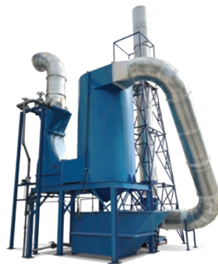
Venturi Wet Scrubbers