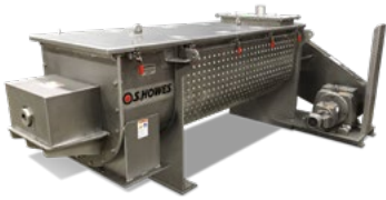
Thermal Screw Conveyors

S. Howes has been designing and manufacturing custom, quality, and American made industrial processing equipment for generations. Our mixing, conveying, screening, size reduction, and filtration equipment are built to last a lifetime. In fact, we have equipment built 75 years ago that is still in use today.