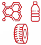
Chemicals, Plastics, Rubber

CPEG serves many industries worldwide with innovative equipment solutions for powder and bulk solids processing and material handling. Our industrial manufacturing companies and comprehensive product line is recognized around the globe for reliability and performance.